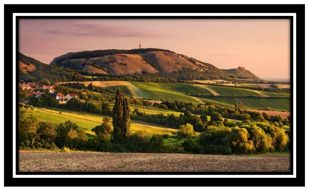
Pálava – Devín Mountain

Where is the best starting point to explore the beauty of the Pálava Region? Most would say it is the fairytale town of Mikulov, whose dominant feature is the Baroque chateau perched high on a cliff. The town of Mikulov is situated in the very centre of the winegrowing region of South Moravia in the magnificent Pálava nature reserve. In addition to stops at local and family wine cellars or tasting of wines in wine bars and wine restaurants, the visit also includes the historic chateau cellar with expositions of traditional viticulture. The huge richly decorated Renaissance wine cask with a volume of 101,400 litres and weight of 26.1 tonnes is the largest one in the Czech Republic. The Museum expositions represent, in addition to the local viticulture, the history of the chateau and the aristocratic family of Dietrichsteins, archaeology and attractive seasonal exhibitions.