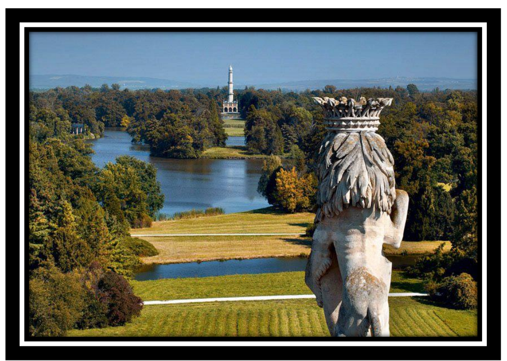
Lednice Park and Minaret

The other chateau – Valtice – was the spectacular residence of the Austrian and Moravian Lords of Lichtenstein. It is known not only for its beauty, but also the long tradition of winemaking. Grape vines were brought here by the Roman legion of Emperor Marcus Aurelius, who regarded the area of Pálava as suitable for cultivation of wine. You can thus enjoy not only a unique cultural experience, but also a glass of superb Moravian wine in the Wine Salon here. The park here, surrounding both chateaux, is one of the most luxurious landscapes in Europe.